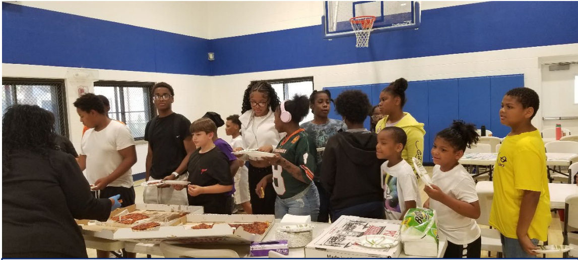
Griswold Heights Homework Club and staff getting ready for pizza