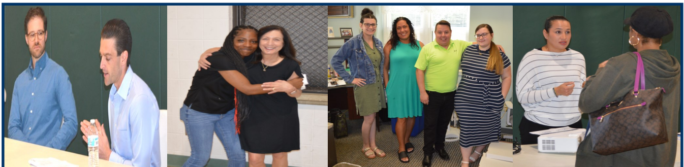
THA, MDG and Griswold Heights Residents discuss renovations