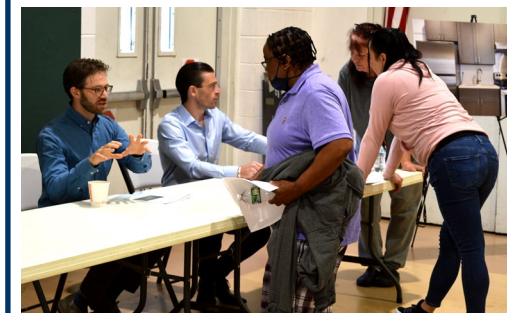
Griswold Heights residents meet MDG