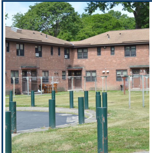
Eyesore will be removed during renovations

HTH will be holding a Renovation Needs Assessment meeting to assist all Griswold Heights residents with their individual needs and circumstances. HTH will help each resident make arrangements to make sure units can be accessed by the construction team to complete renovations.